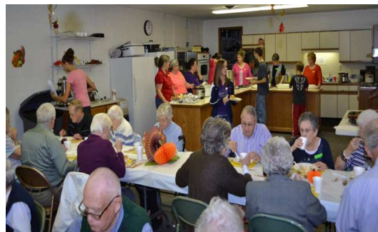
Our ladies hard at work...