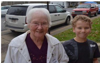
Thank you to the youth that helped at the luncheon.