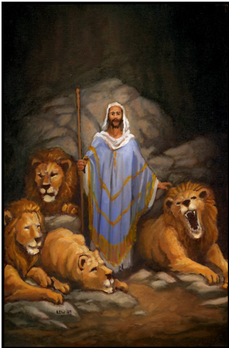
Dare To Be A Daniel