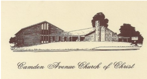
Camden Avenue Church of Christ