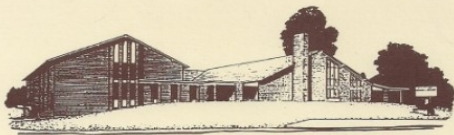
Camden Avenue Church of Christ

Let the office know of any corrections or updates for the calendar.