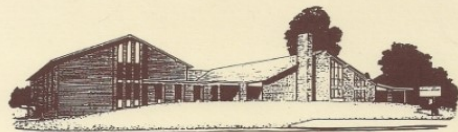
Camden Avenue Church of Christ