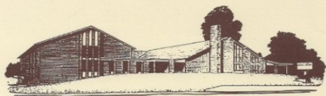
Camden Avenue Church of Christ