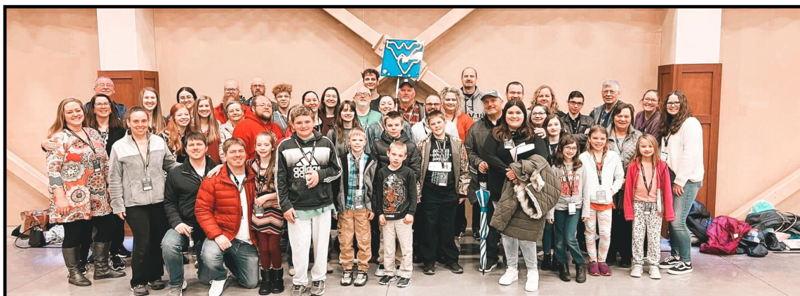
CAMDEN AVENUE 2022 CYC GROUP